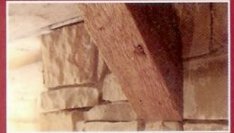
Rustic Element Preservation