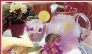
The Art of Living