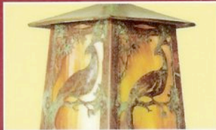
Old California Lanterns